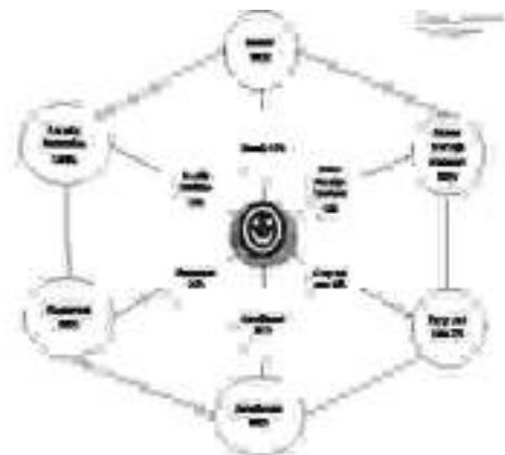
Achievements after the execution of the project.

The weaker the connection you have with someone the harder it is to get your point across. The difference between an interaction & a relationship is a matter of frequency. This was well understood when the number of PTM'S were increased. They have become an integral part of the system where their views, feedbacks are frequently called for. With the combine efforts of teachers, students, parents and management we were able to achieve improvements in our KPA's.