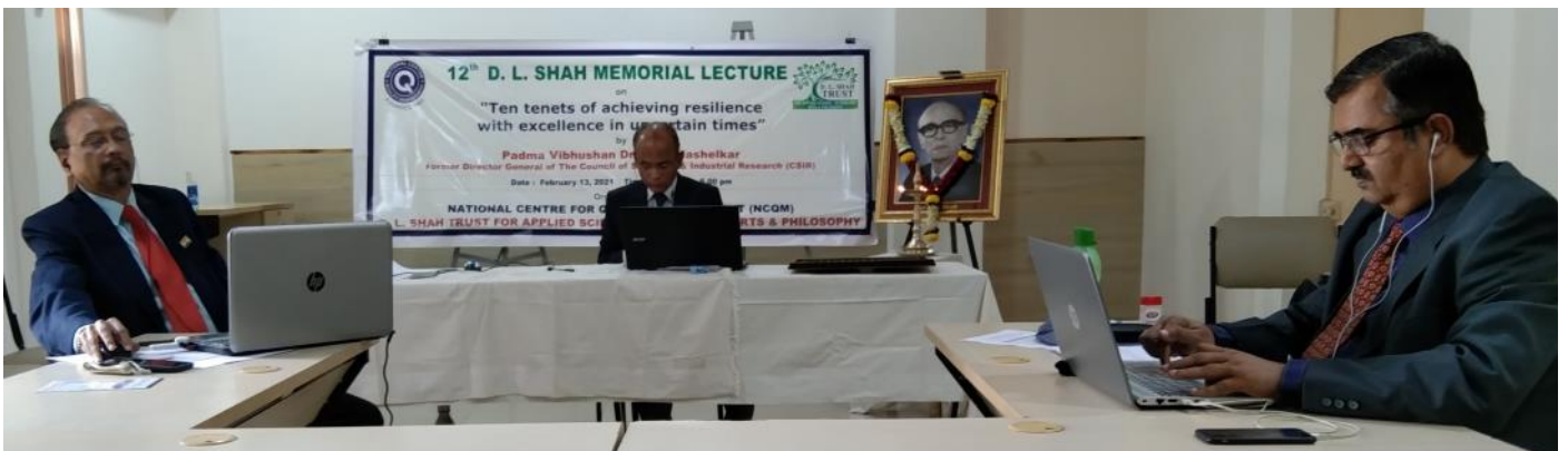
NCQM Office Bearers at NCQM office for the virtual 12th D L Shah Memorial lecture