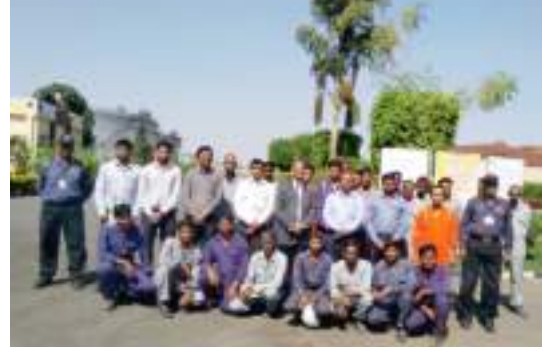
Team - BPCL Manglia Receipt Terminal 5S Certified, Under Very Good Category