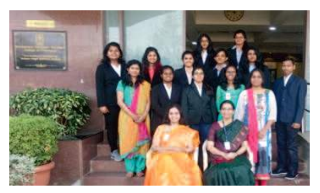
Team with Principal of VES College of Pharmacy

As they progress, they will carry in their minds their responsibility towards betterment of health in society and align their goals with those of the society.